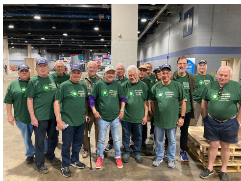
June/July 2023 Issue: MEL Visits the Greater Chicago Food Depository