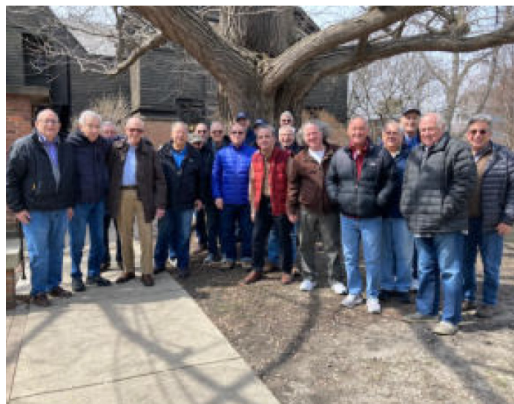
April 2023 Issue: MEL Visits Frank Lloyd Wright Home and Design Studio