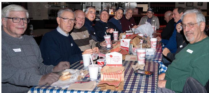
January 2023 Issue: Mel Photo Club holiday Dinner