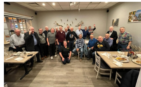
September/October Issue: MEL Monthly Breakfast—The Tradition Continues