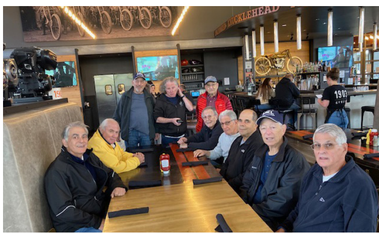
October/November Issue: Vroom! Vroom! MEL Eats Up HOGS