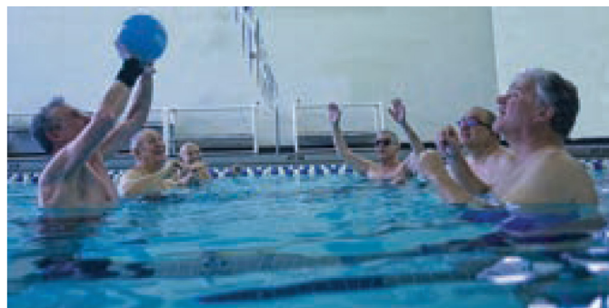
February 2023 Issue: MEL Plays Water Volleyball