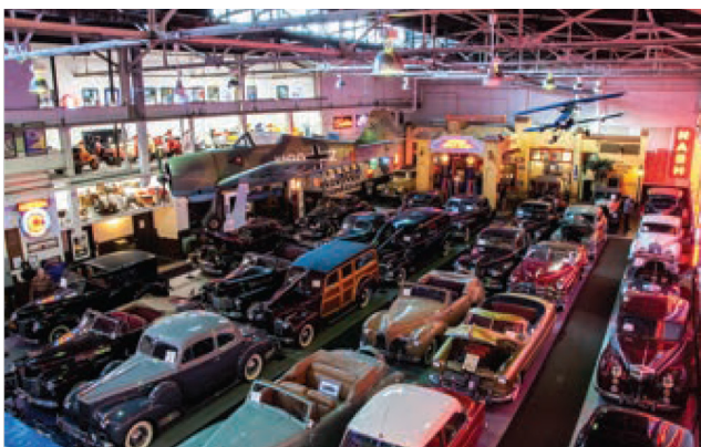
March 2023 Issue: MEL Visits the Klairmont Kollection