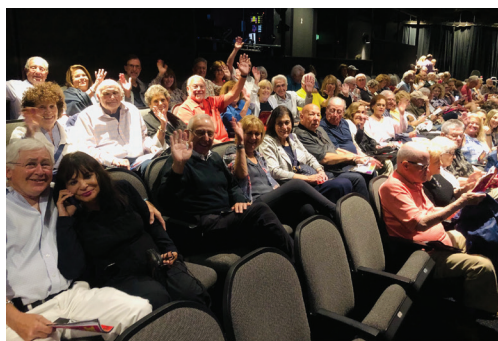
July/August Issue: MEL Rocks Out with Buddy Holly