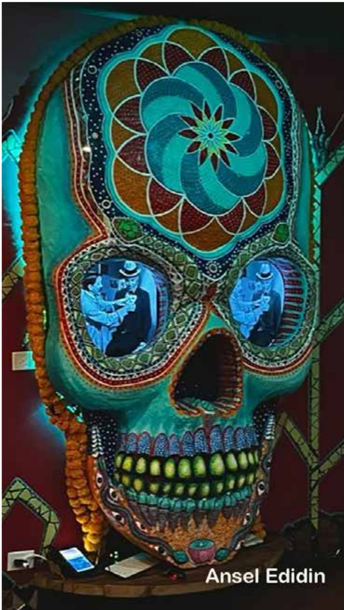
Day of the Dead Watching Dead Actors. Taken on an iPhone 13 at Zentli Restaurant Halloween Weekend. This picture was behind the bar; it was a must.