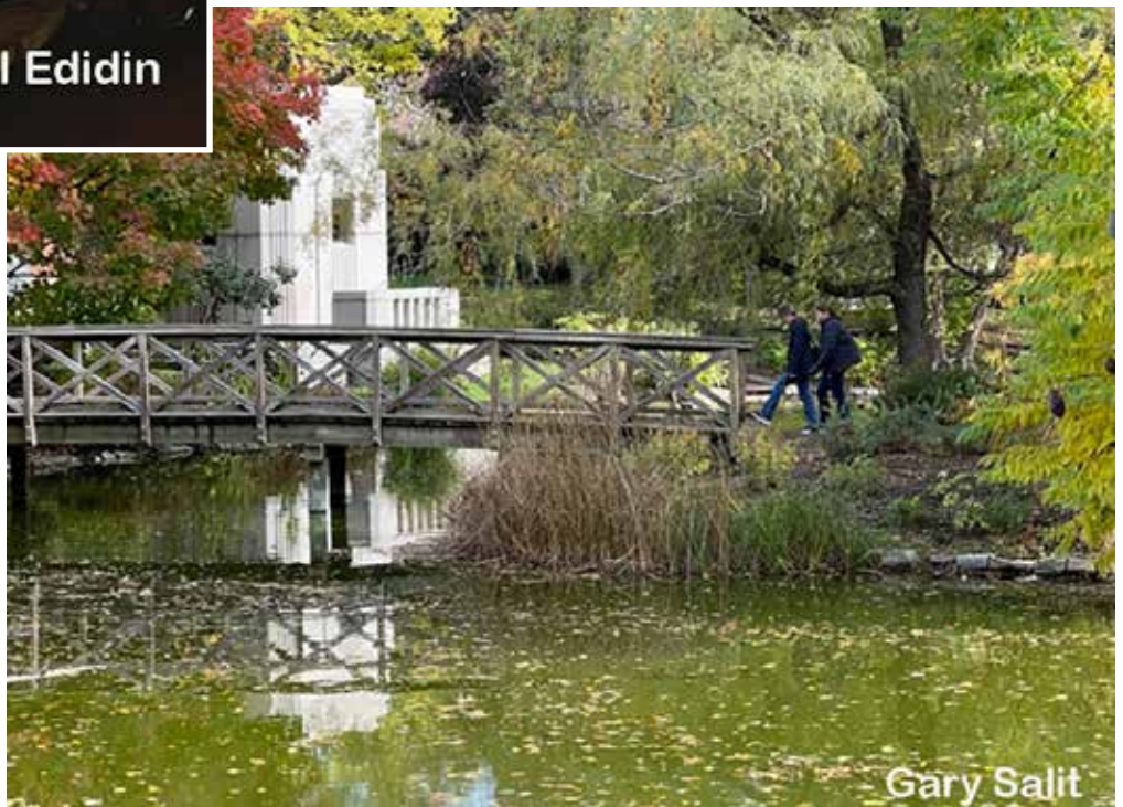
Autumn on the Farm. Taken in Sycamore, IL on an iPhone 12. The lovely fall colors as sunset was approaching and the interesting geometric shapes with the triangle of light in the background.