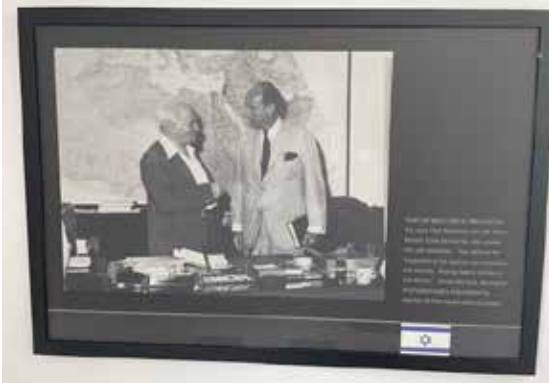
Stevenson visits with David Ben Gurian.

On Nov. 28, the day after this season's 1st snowfall, a group of 23 hardy Melmen toured the Adlai Stevenson Home in Mettawa, IL. Despite the freezing temps, the group easily related to the warm and generous spirit on display at the family residence of one of Illinois' greatest statesmen.