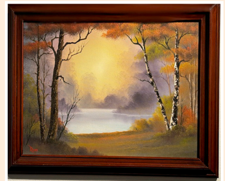
One of Bob Ross' original paintings