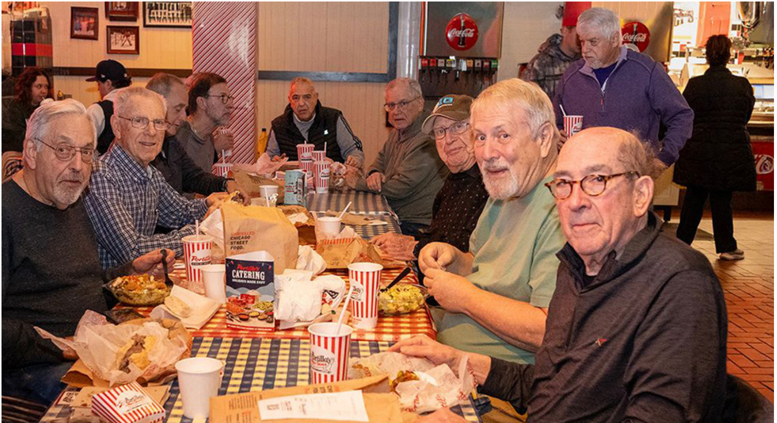
MEL Photo Group meets at Portillo's.