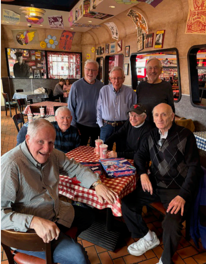
Rummikub crew meets at Portillo's