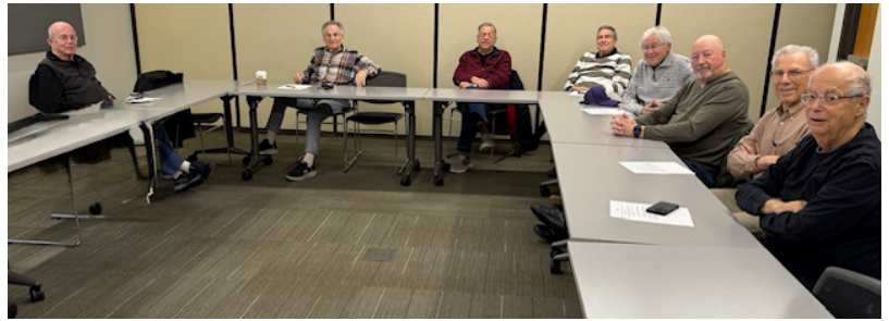
MEL Travel Club meeting live and via Zoom at Deerfield Public Library.