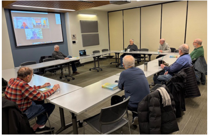
MEL Book Group meets live and via Zoom