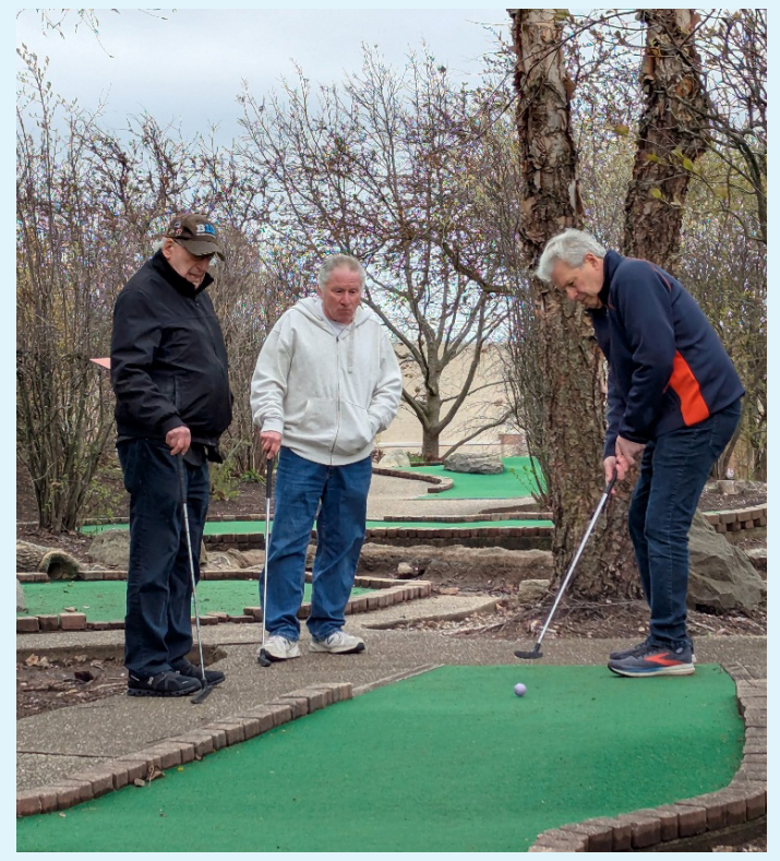
It's just miniature-golf.