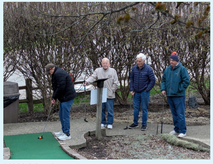
I think he's frozen!