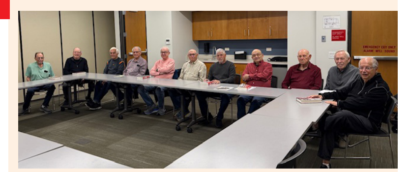
MEL Book Group on 5/29/2025; plus two on Zoom.