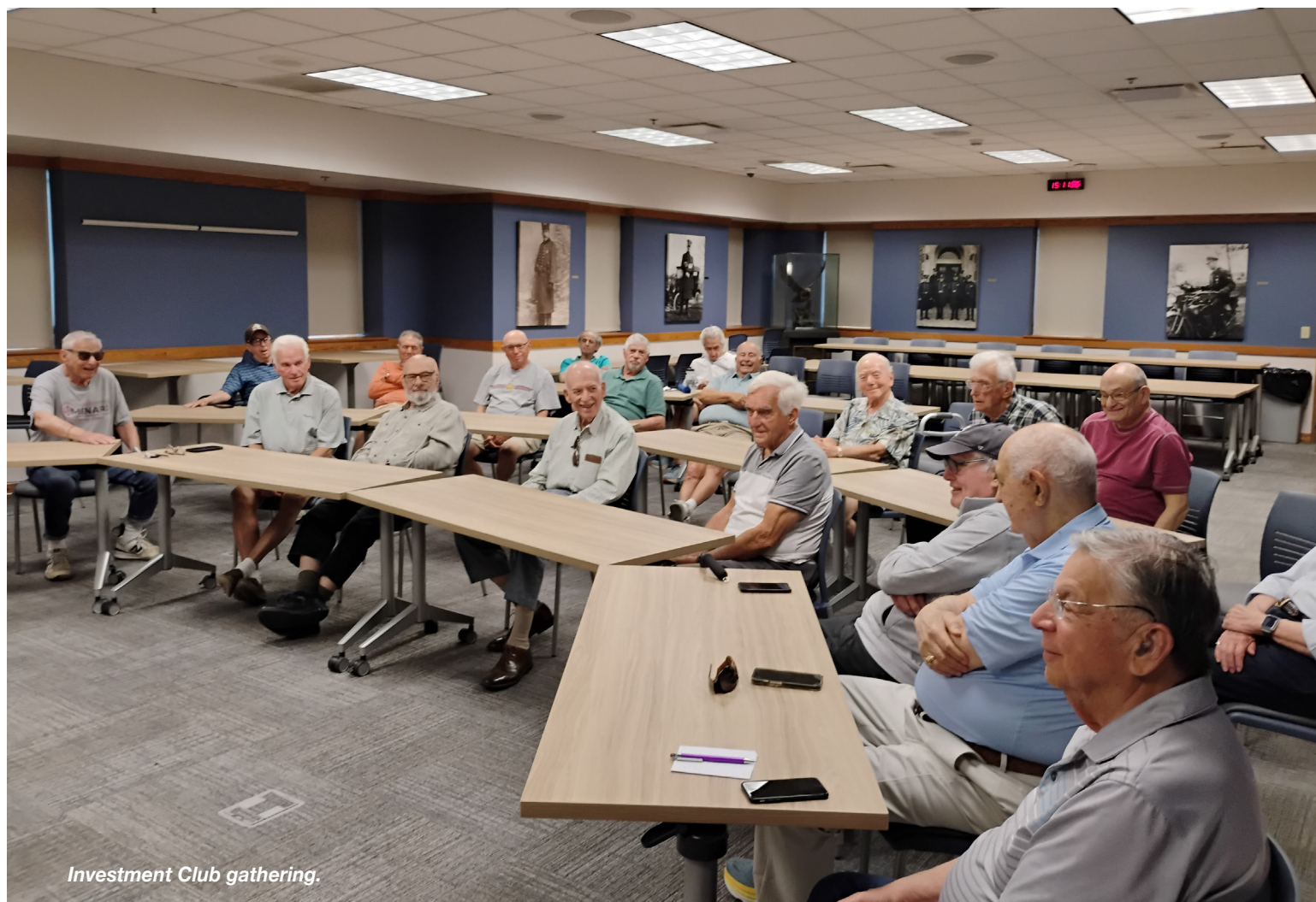
Investment Club gathering.