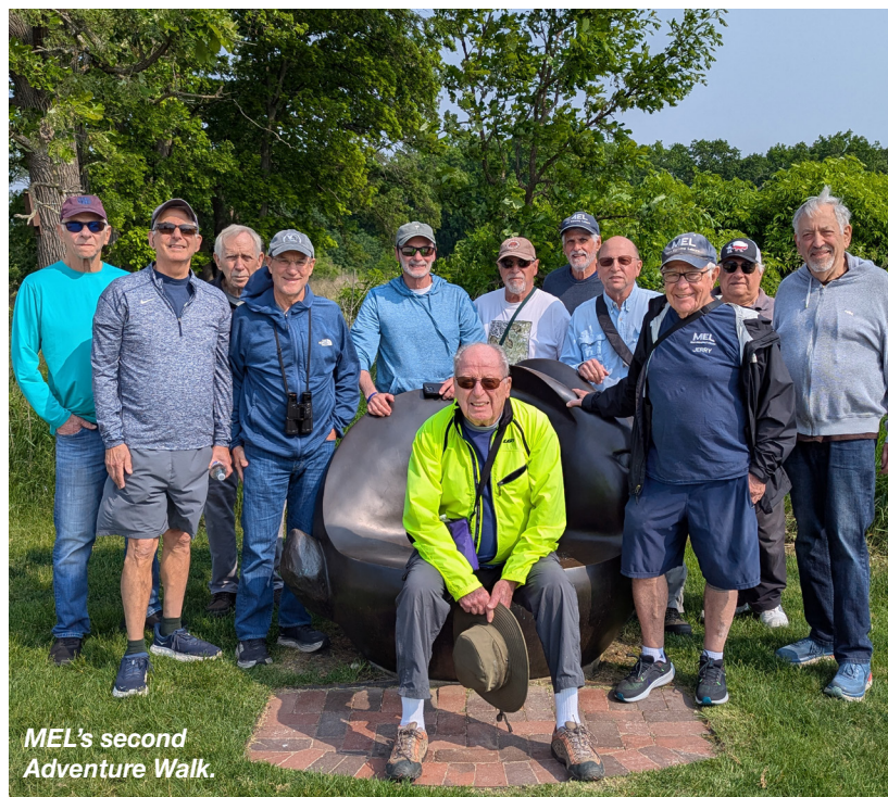
MEL's second Adventure Walk.