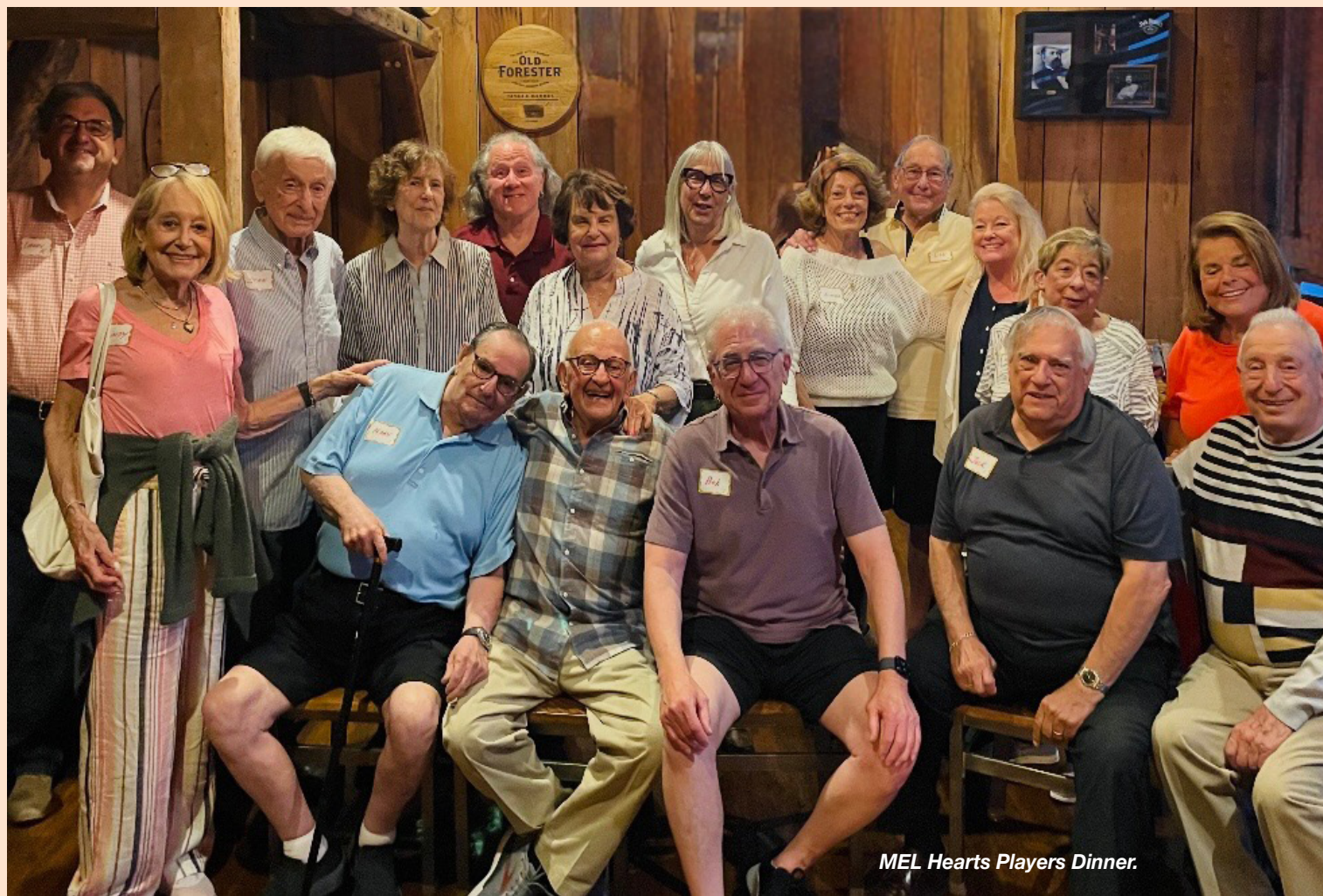
MEL Hearts Players Dinner.

The annual dinner for hearts players was held on Tuesday June 17th at Spears Bourbon Burgers and Beer in Wheeling. Eleven Melmen attended with spouses, d-p's ,s-o's, or girlfriends. Fortunately, no-one brought two.