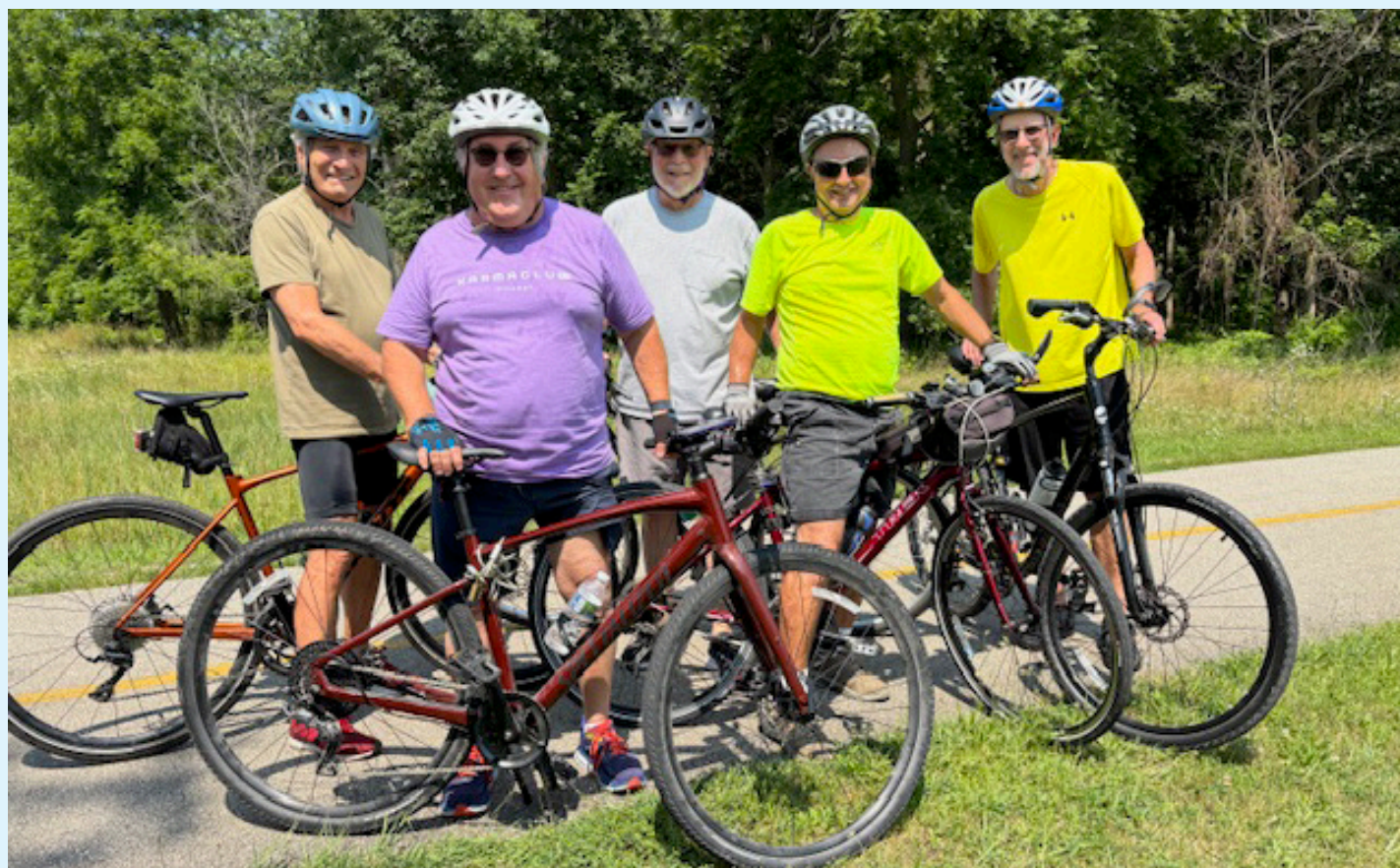
MEL Slow Bike Group on 7/14/2025.