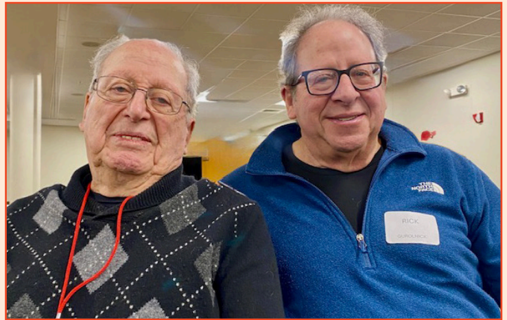
MEL's First Father-Son Members!