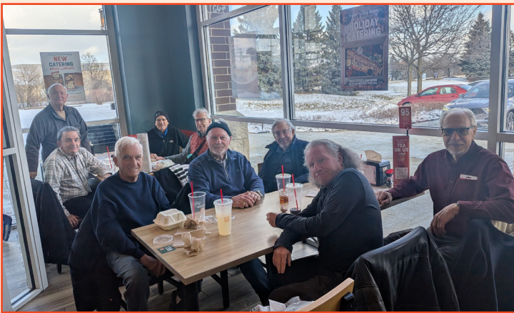
MEL Eats Lunch 1/15/2026