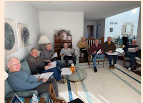
Meltones Still Rehearsing