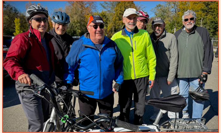
MEL Slo Bike Group End of 2025 Season