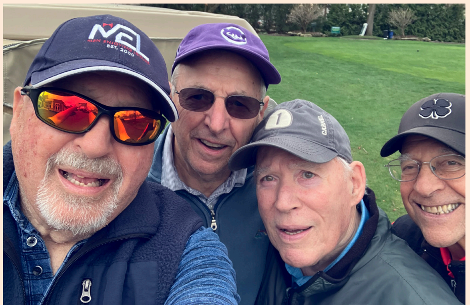
First golf outing.