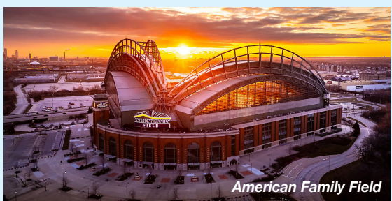
American Family Field