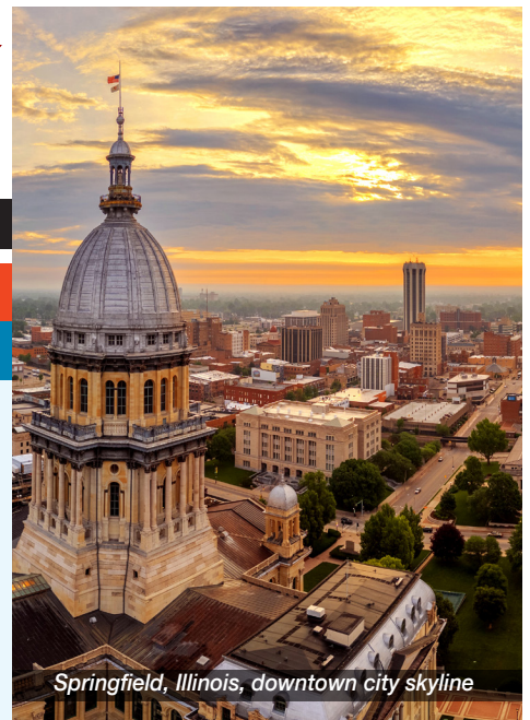
Springfield, Illinois, downtown city skyline