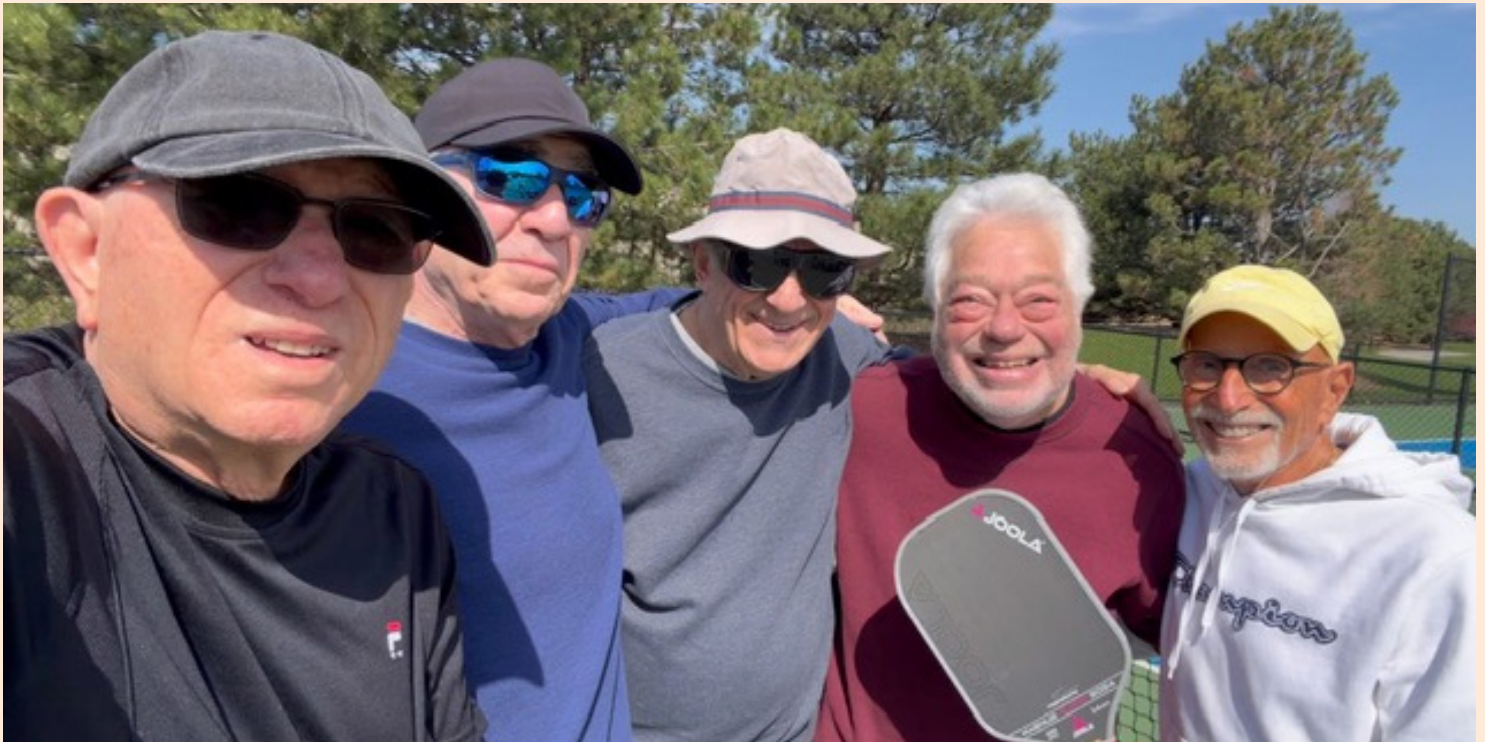
First day of pickleball outside.