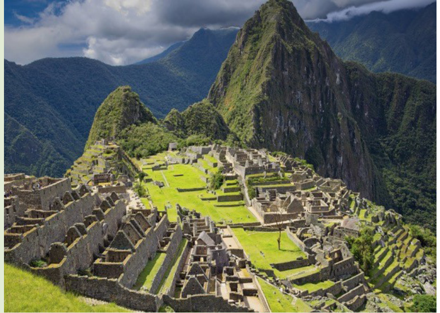
Machu Pichu