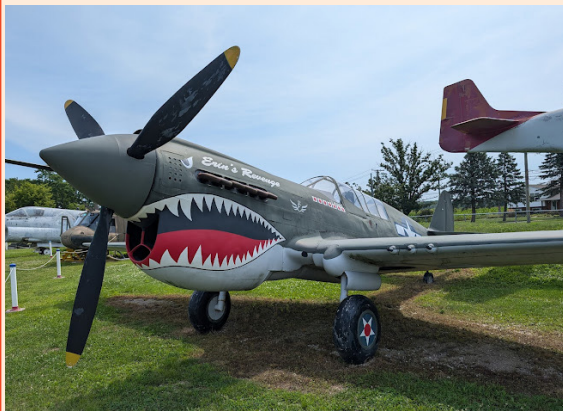
Air Classics Museum